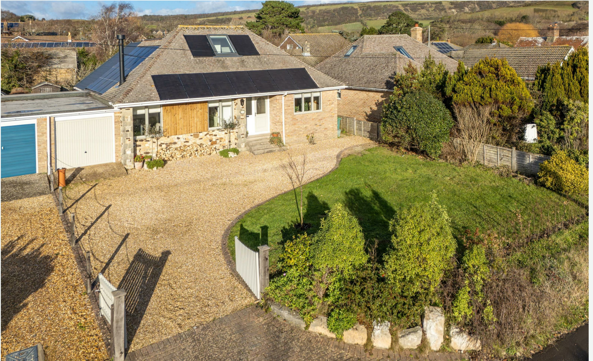
Quicks Hunny Hill, Brighstone, Newport, PO30 4DH